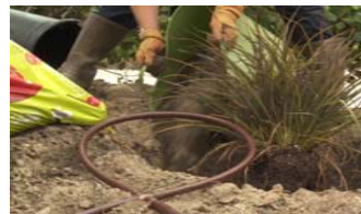
Amending Soil with Compost